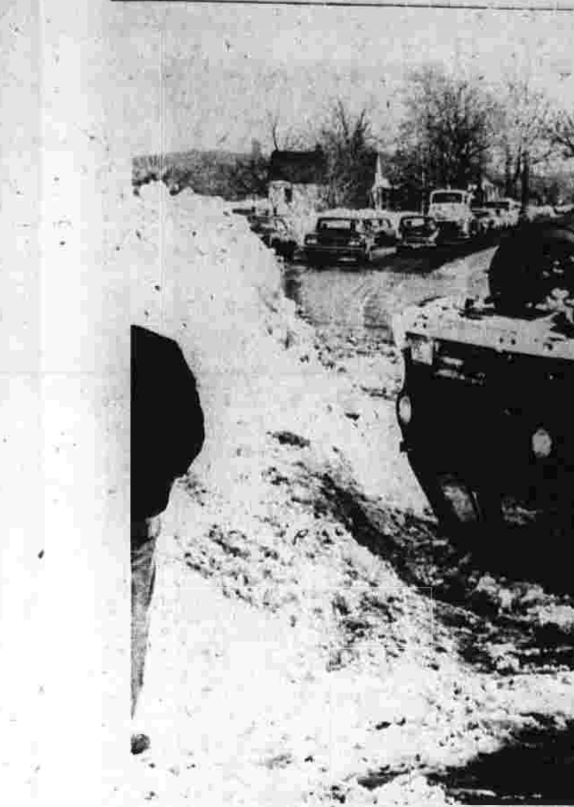
Florist Truck Flips and Everything's Turning Up...

Michael's DOWNTOWN MANCHESTER—305 MAIN STREET We give credit to young adults